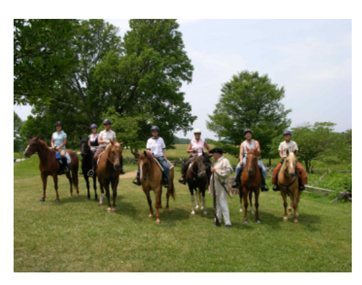
HAMT members with Colonial camp re-enactor.