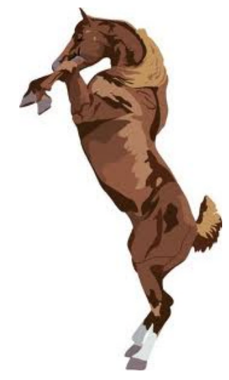
The next installment will be a "Pre-quel"...stay tuned!

The bone healed, the fingernail grew back (in about 6 months) and all was well again.